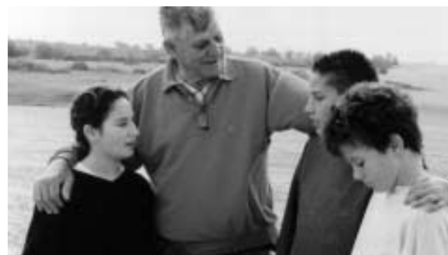
A new generation of pioneers in the Eshkol Region